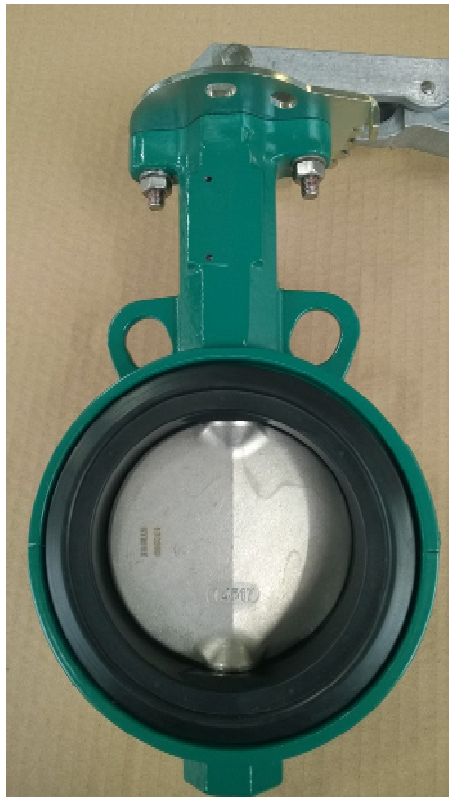
KG9 with new disc material

Disc-Material has changed from 1.4408 to 1.4517