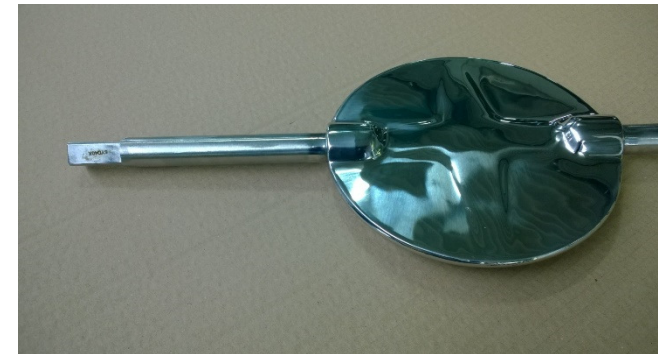
KG6/8 disc polished with charge no. on the square